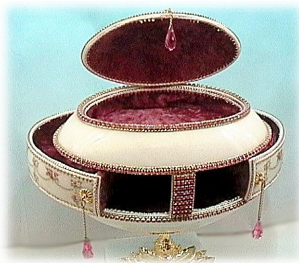
Plate 85 – Rose Swags (open)

To form the top compartment an oval of cardboard covered velvet was glued into position, above the top line of the drawers.