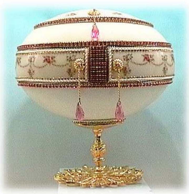
Plate 81 – Rose Swags

At the back of the egg this panel needs to be wide enough to take the width of both hinges. The hinge post faces into the egg and the other side of the hinge is attached to the top of one drawer and the bottom of the other.