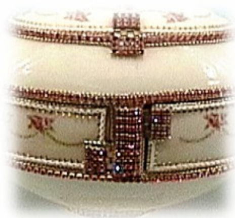
Plate 82 – Hinge Positioning—Rose Swags

A 12 mm ( \frac{1}{2} " ) panel was also marked in on the vertical centre girth line.