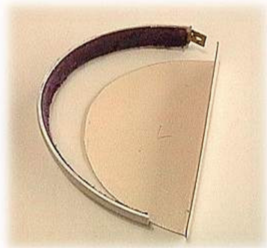
Plate 84 – Drawer Construction

The inside of the shell is lined with a narrow piece of velvet. The cardboard base is also covered with velvet starting from the curved edge, going across the base, up the back of the drawer and across the bottom. Trim the velvet back to the cardboard and use tacky glue to secure the drawer base into the shell.