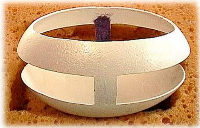
Plate 83 – After Cutting

Once the egg is cut the inside of the front and back panels need to be reinforced with a narrow piece of paper, glued to extend past either edge of the drawer line.