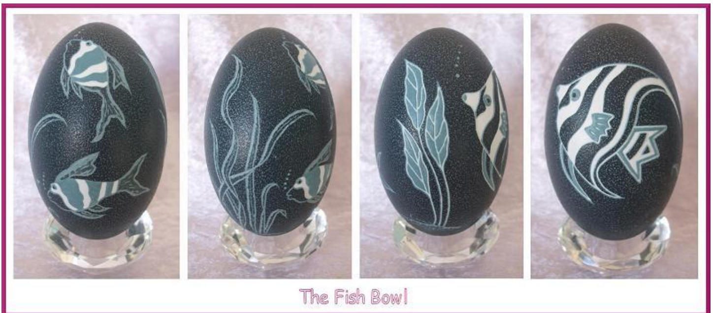
The Fish Bowl!

Congratulations. You have done very well!